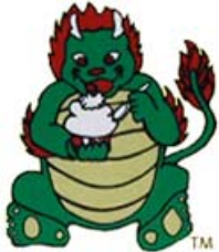
Chinatown Ice Cream Factory

Chinatown Ice Cream Factory – Gift Certificates ($various)